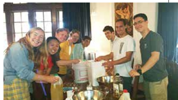
Residents making Challah.

Altogether, the summer and fall this past year have been fun and productive. The residents are always excited and engaged. We are looking forward to more adventures in the spring. 🍷