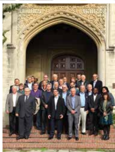
The Bowles Hall Foundation Board of Directors tour Bowles Hall.