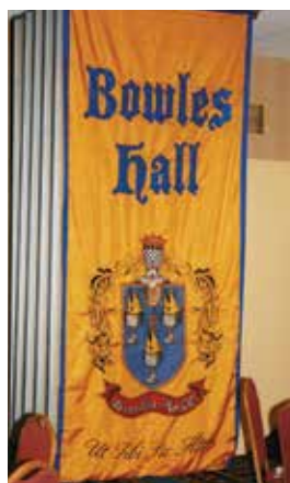
Attendees were delighted by Steve Harvey's gracious Bowles Hall banner donation.