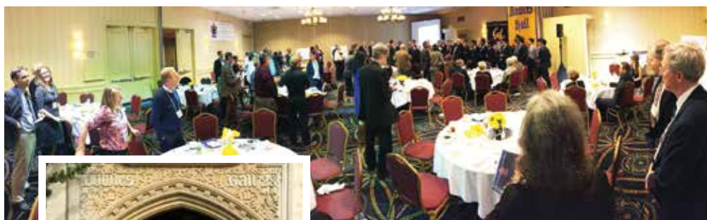
The 2014 Big Game Dinner was our biggest ever: 106 total attendees, including 25 current students.